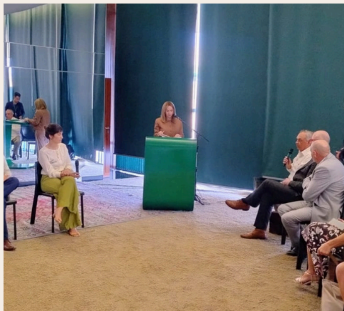
The State Deputy of Acre, Socorro Neri, delivers a speech at the Amazonian Parliament Assembly.